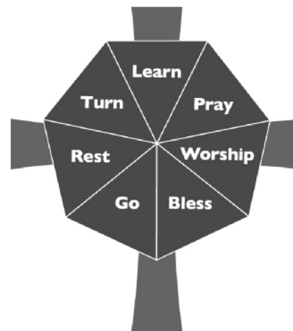
THE WAY OF LOVE Practices for Jesus-Centered Life